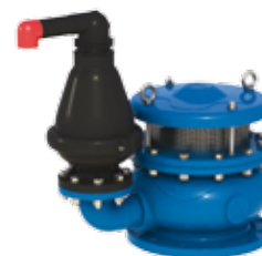
VB-060 + D-025

Please see the table below for all the additional air valve options available.